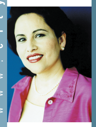
FREE Admission & Parking!

We invite you to The Diversity Employment Day Career Fair being held on Diversity Employment Day for Boston. Tuesday. May 8. 2007 as proclaimed by the City and the